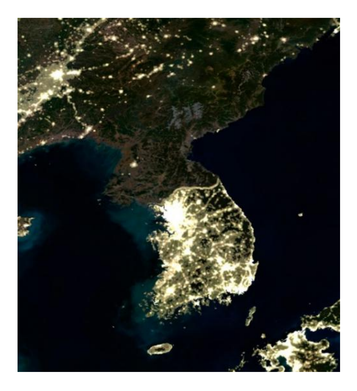
Korean Peninsula at night, satellite image shows a contrast (and border) between North and South Korea.