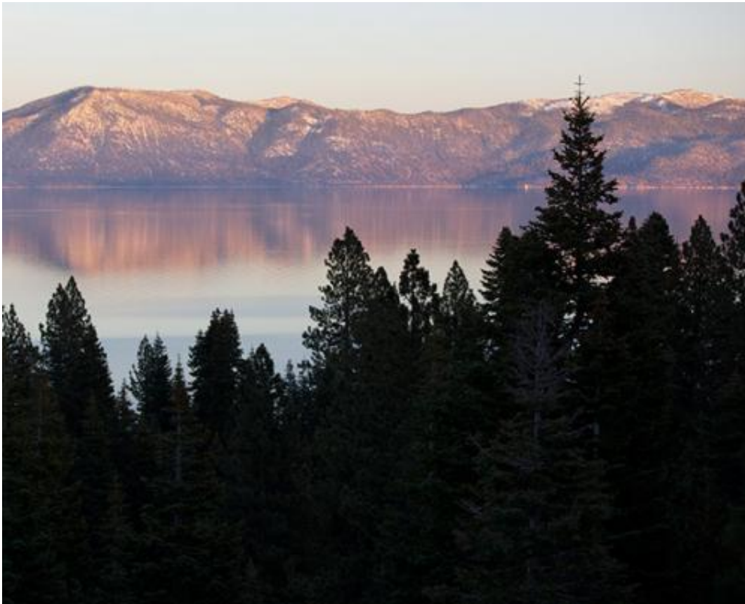
mountainous view of Lake Tahoe.

The Lake Tahoe ecosystem is experiencing rapid change due to regional warming and shifts in precipitation patterns, as well as increased atmospheric nitrogen deposition, which has begun to alter the nutrient balance in the lake.