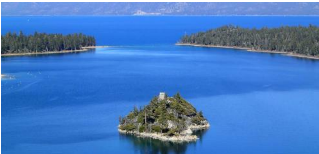
A view of Lake Tahoe's Emerald Bay and iconic blue water.

The Scripps Oceanography and UC Davis Tahoe Environmental Research Center team filtered water from three lakes within the Lake Tahoe basin to collect molecules dissolved in the water. Their findings suggest that something is preventing the efficient recycling of nitrogen in these ecosystems, and one possibility may be phosphorus limitation of the recycling bacteria (bacteria need both nitrogen and phosphorus to live).