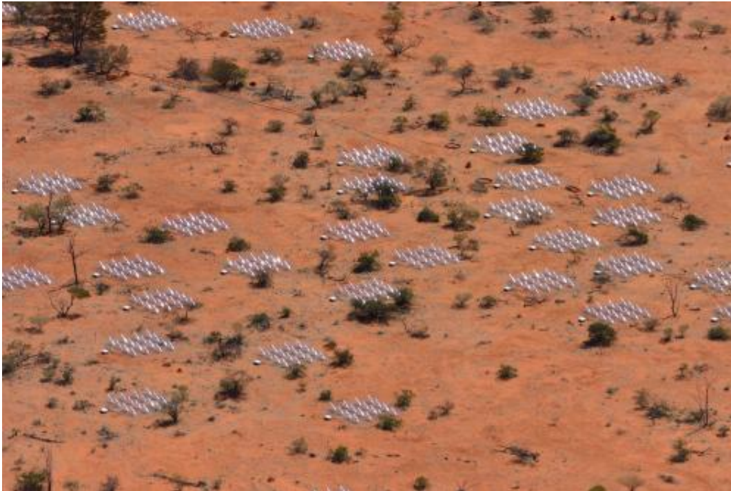
Part of the Murchison Widefield Array radio telescope, Western Australia.

The MWA is a A$50-million science and engineering precursor for the SKA, specifically the low frequency SKA, which will be approximately 100 times bigger than the MWA.