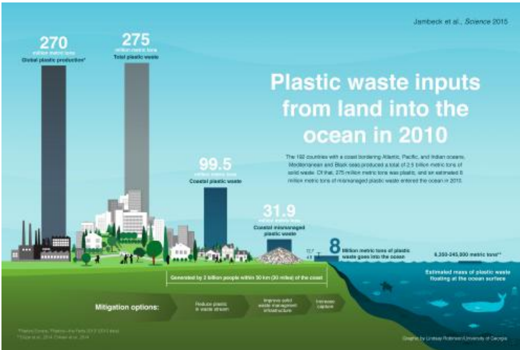
Plastic waste distribution.

As the gross national income increases in these countries, so does the use of plastic. In 2013, the most current numbers available, global plastic resin production reached 299 million tons, a 647 percent increase over numbers recorded in 1975. Plastic resin is used to make many one-use items like wrappers, beverage bottles and plastic bags.