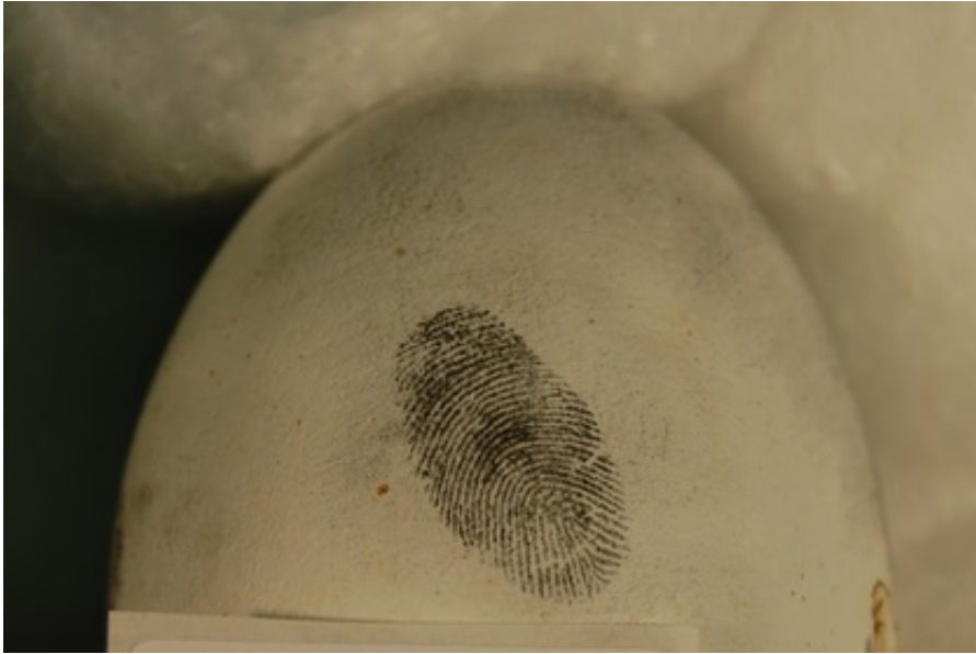
Fingerprint on a golden eagle egg

"So, what we have done is establish which fingerprint powders would be most effective at developing fingermarks on the flight feathers of birds of prey.