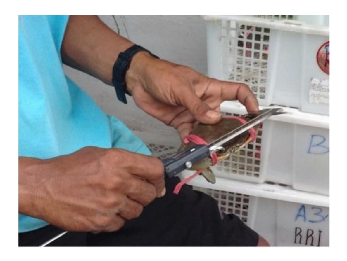
Researchers measuring a crab.

Once the crablets are large enough, they can be put into ponds for fattening. Blue swimmer crabs can be cultured with herbivorous fishes in saltwater, and should be harvested within 150 days. Mud crabs require longer to rear, from six to eight months in a brackish water pond.