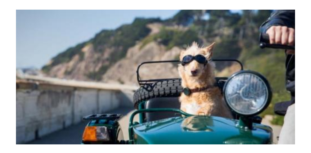
Wearable tech isn't just for humans.

With the likes of <u>Google Glass</u>, <u>Fitbit</u>, and <u>Emotiv</u> wearables are now a familiar concept. Perhaps less known is that animals have been fitted with wearable technology for decades.