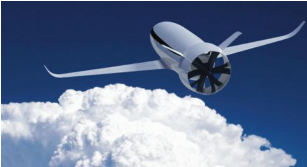
VoltAir, all-electric aircraft concept.

Putting together this increase in computational power and decrease in circuit size, and adding in the progress made with 3D-printing, at some point in the next decade we will be able to produce integrated computers powerful enough to control an aircraft at the equivalent of the cellular level in near real-time – wireless interlinking of nano-scale digital devices.