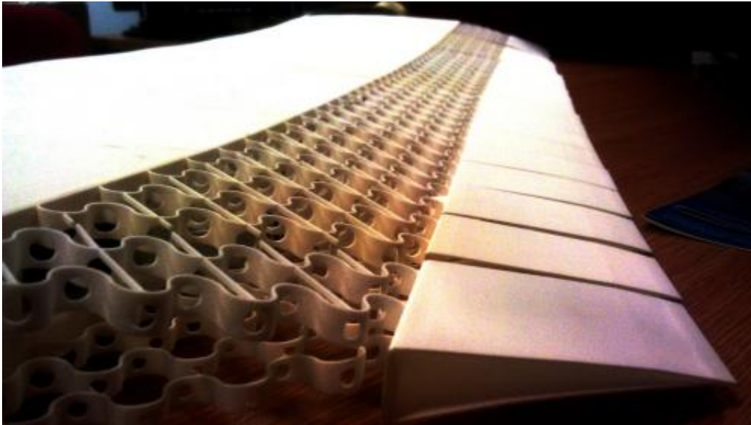
Skeleton of trailing edge of wing morphing wind-tunnel demonstrator concept Ash Dove-Jay, University of Bristol

gimballed propulsion system, one that can provide thrust in any direction. This will remove the need for the elevators, rudders, and tailplane control surfaces that current designs require, but which add significant mass and drag.