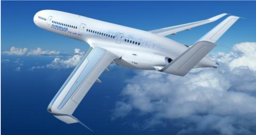
Airbus 2050 concept plane.