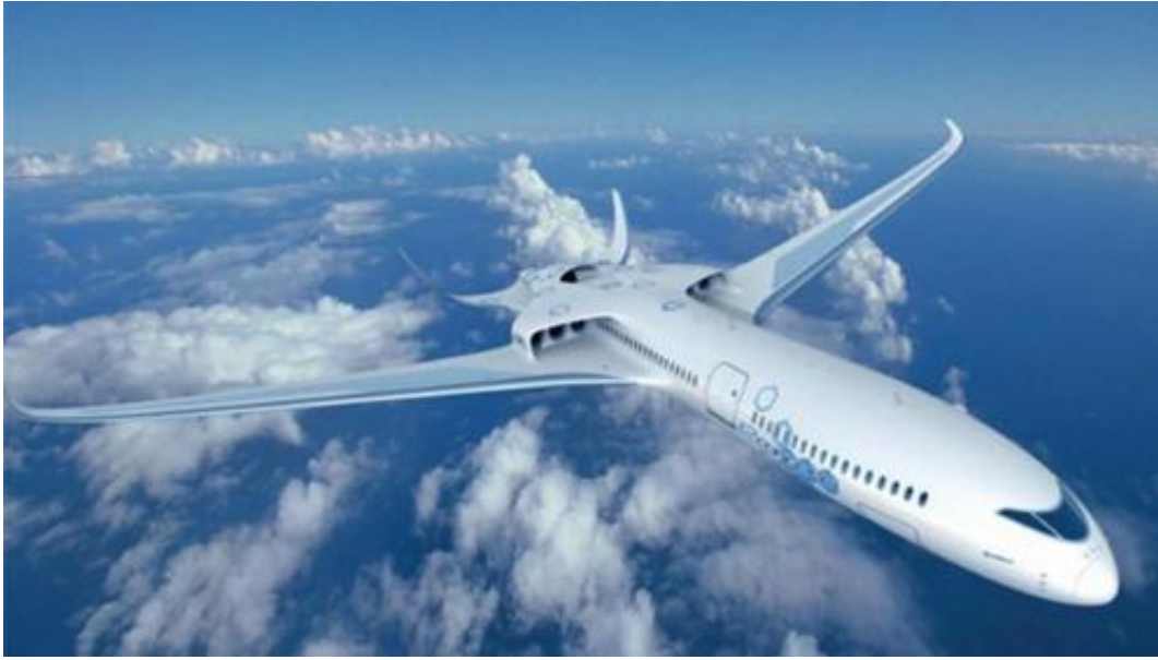
E-Thrust Project.