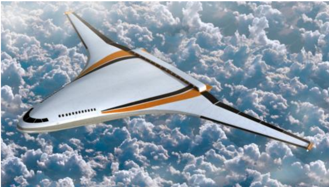
Blended Wing Body.