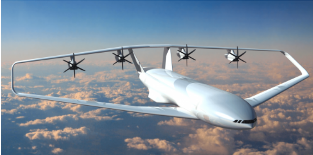
Prandtl Plane air freighter.

This story is published courtesy of The Conversation (under Creative Commons-Attribution/No derivatives).