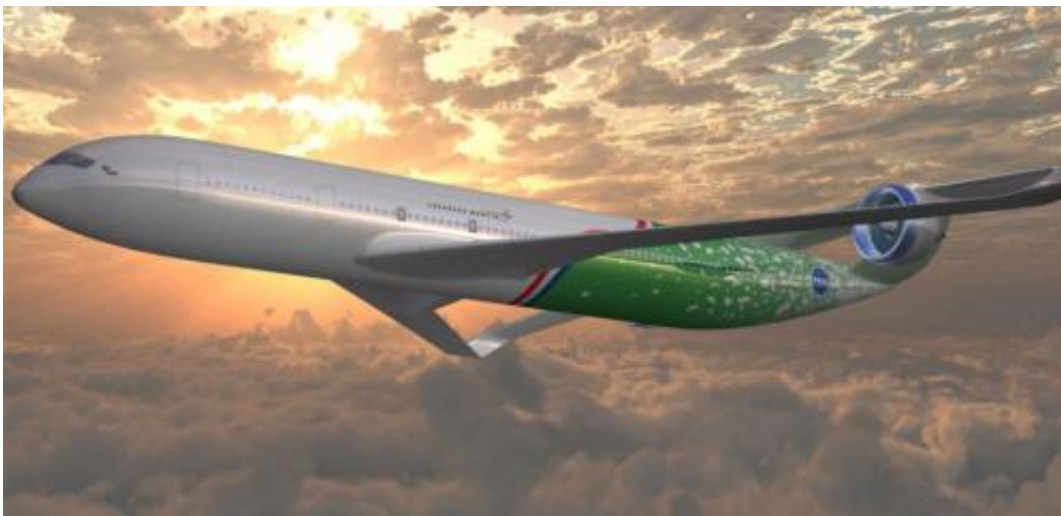
Electric aircraft.