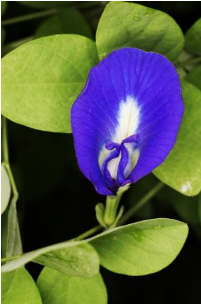
Close up photo of the Blue Butterfly Pea flower

"While we already have the tools to cut peptides easily, joining them together is much harder, as the most commonly used ligase usually leaves residues behind, which may affect the efficacy of the final product," said the director of NTU's Drug Discovery Centre.