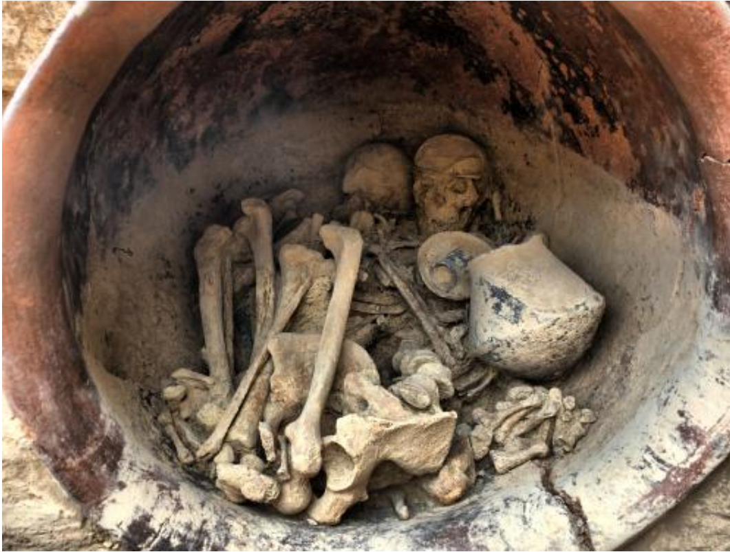
Interior of the royal tomb with the skeletons and grave goods.