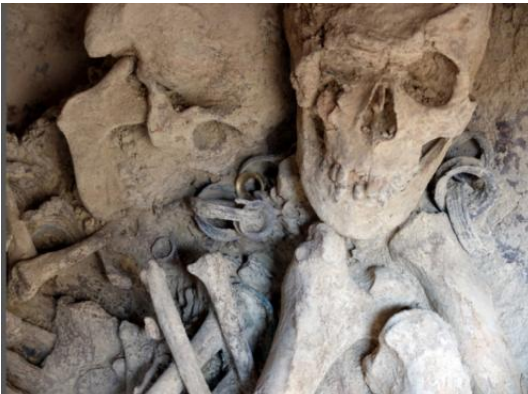
Detail of the jewels, with the golden and silver ear dilators.

La Almoloya contains many unknown answers and offers many promising perspectives for future digs. The completion of the urban tissue and revealing the details of the first political structure of the West are some of the challenges remaining, archaeologists conclude.