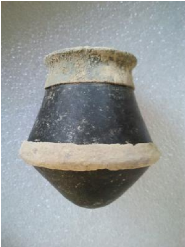
Small cup decorated with silver.