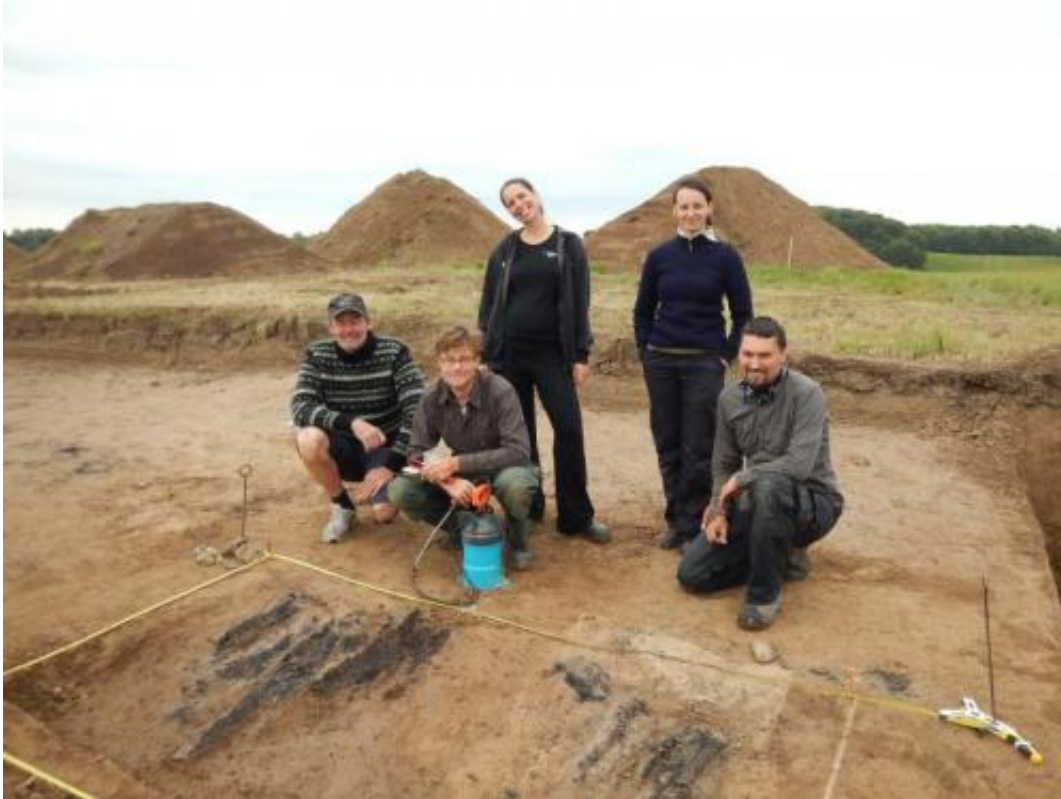
Photo from on fields at Vallø Estate, near Køge, in Denmark.