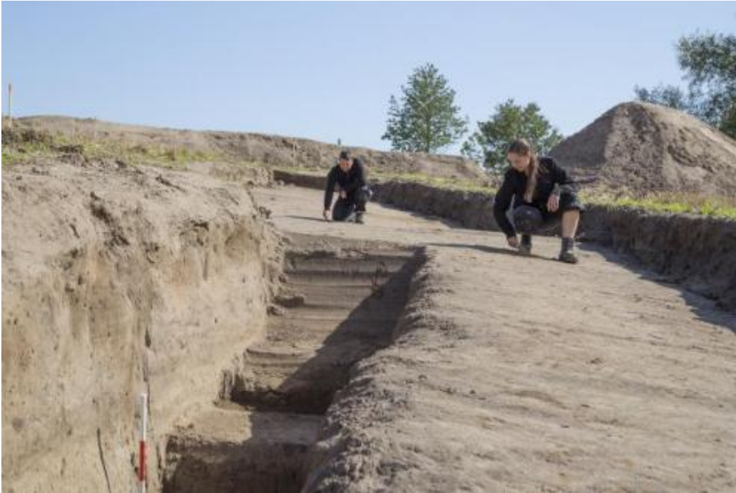
Photo from on fields at Vallø Estate, near Køge, in Denmark.