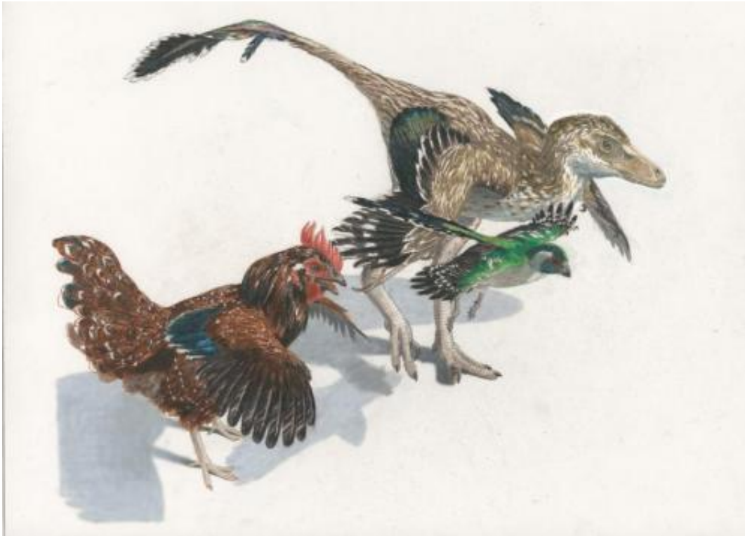
Velociraptor, Cretaceous bird, and chicken. Credit: Jason Brougham

The most comprehensive family tree of meat-eating dinosaurs ever created is enabling scientists to discover key details of how birds evolved from them.