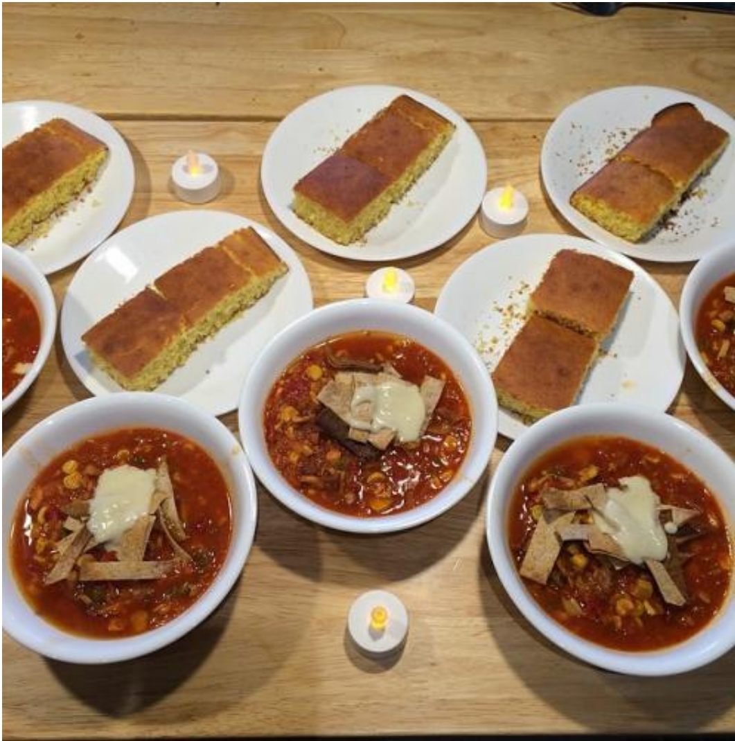
Chicken tortilla soup with freshly baked corn bread. #HISEAS