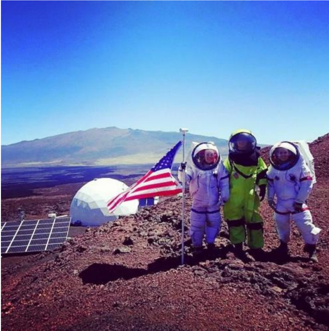
The 3 Americans of the 2nd #HISEAS crew celebrate #IndependenceDay #Mars #Hawaii #Space #NASA