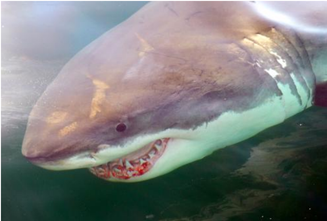
A large white shark encountered off Massachusetts.

Newborn white sharks, as small as 4.0 feet long, regularly occur off Long Island, New York, suggesting this area may provide nursery habitat. The largest shark in the study considered accurately measured was a female landed on Prince Edward Island, Canada, in August 1983. The animal measured 17.26 feet from the tip of its snout to the fork in its tail.