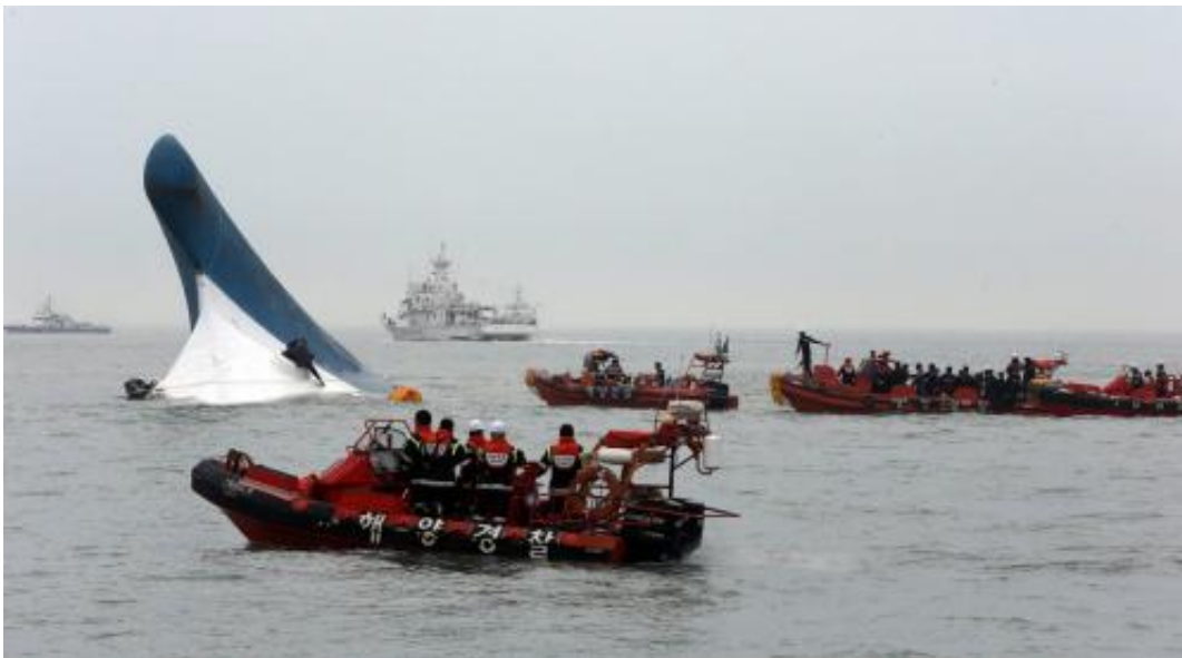
South Korean coast guard around the sunken ferry Sewol, off South Korea, April 16, 2014.

Traditional approaches to safety of life at sea are likely to face increasingly scrutiny as the trend continues to build ever-bigger cruise liners which resemble nothing less than floating cities.