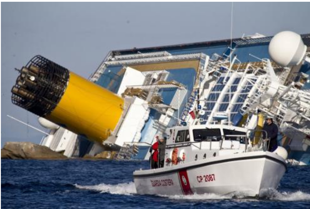
The grounded Costa Concordia', off Giglio Island, Italy, January 17 2012.

The International Convention for the Safety of Life at Sea ( SOLAS ) sets a minimum standard of enough lifeboats to be carried to accommodate at least 75% of those on board (37.5% on each side). Enough liferafts should be provided for the remainder. So far, so good.