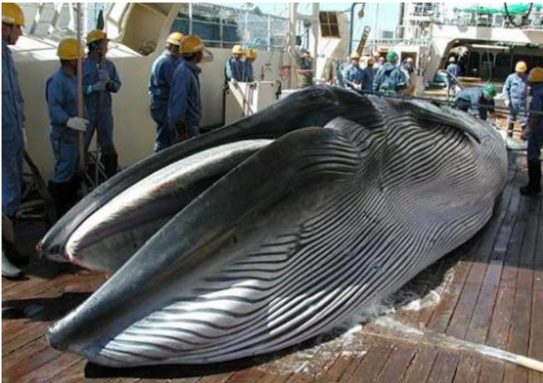
Photo taken by Japan's Institute of Cetacean Research in 2013 shows a Bryde's whale on the deck of a whaling ship in the Western North Pacific

But dealing in whale meat "does not violate international or domestic laws in any way", said Agriculture, Forestry and Fisheries Minister Yoshimasa Hayashi.