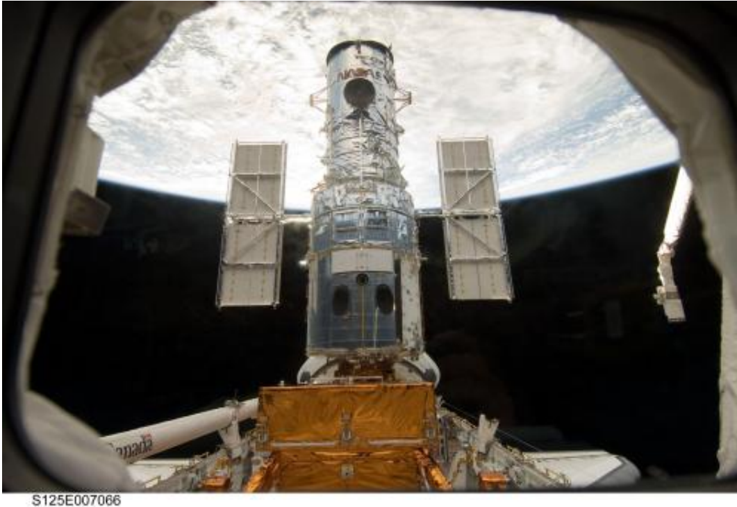
A view of the Hubble Space Telescope from inside space shuttle Atlantis on mission STS-125 in 2009.