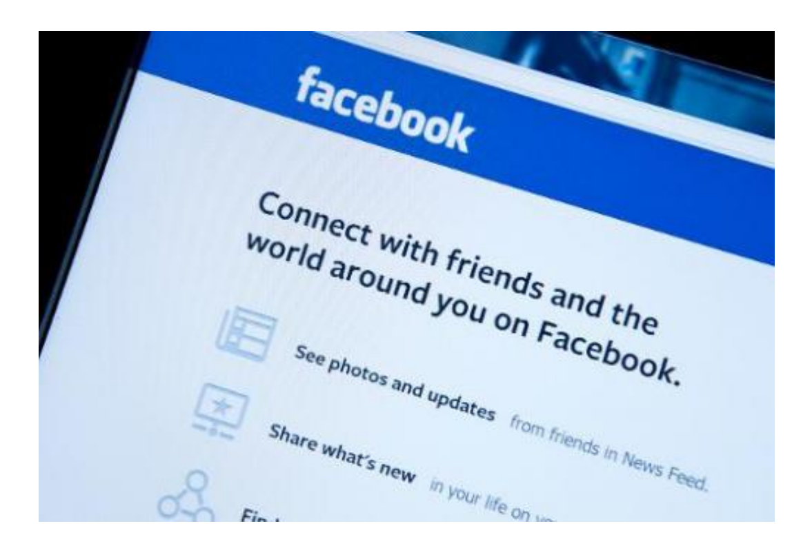
This January 30, 2014 photo taken in Washington, DC, shows Facebook

Young people have simpler lives and, as a result, can focus their brain power on "what's important," not like those old people distracted by families and such, according to his reasoning at the time.