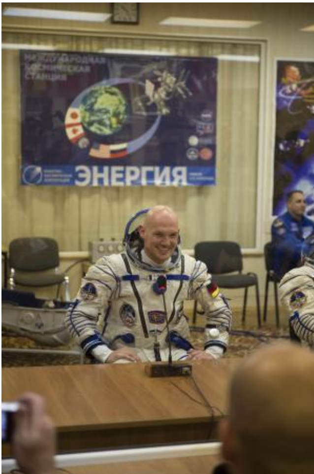
Alexander Gerst dressed in his Russian Sokol suit.

As a flight engineer, Alexander will also help to dock ESA's fifth and final Automated Transfer Vehicle, Georges Lemaitre, which is set for launch on 25 July.