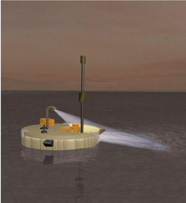
Titan Mare Explorer.

will be about 83% of what you'd get on Earth, all else being equal, which could be sufficient. There would be a premium on sail efficiency and size, and so we might have to take advantage of the low-friction hull to examine shapes with more stability that can house a larger, taller (and presumably high aspect ratio) sail.