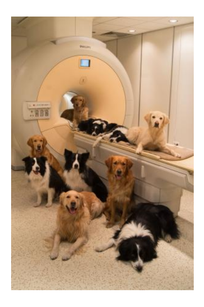
These are dogs at the MR Research Centre (Budapest).

The researchers also noted striking similarities in the ways the dog and human brains process emotionally loaded sounds. In both species, an area near the primary auditory cortex lit up more with happy sounds than unhappy ones. Andics says the researchers were most struck by the common response to emotion across species.