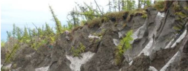
Thawing permafrost sediments at Duvanny Yar, eastern Siberia

acts like a giant freezer, preserving countless plant and animal remains of the past ecosystem of Beringia.