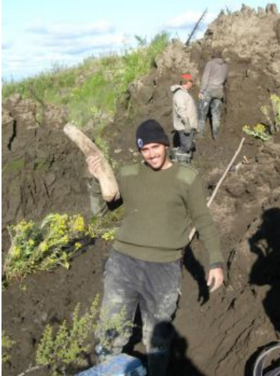
A field worker holds part of a mammoth tusk