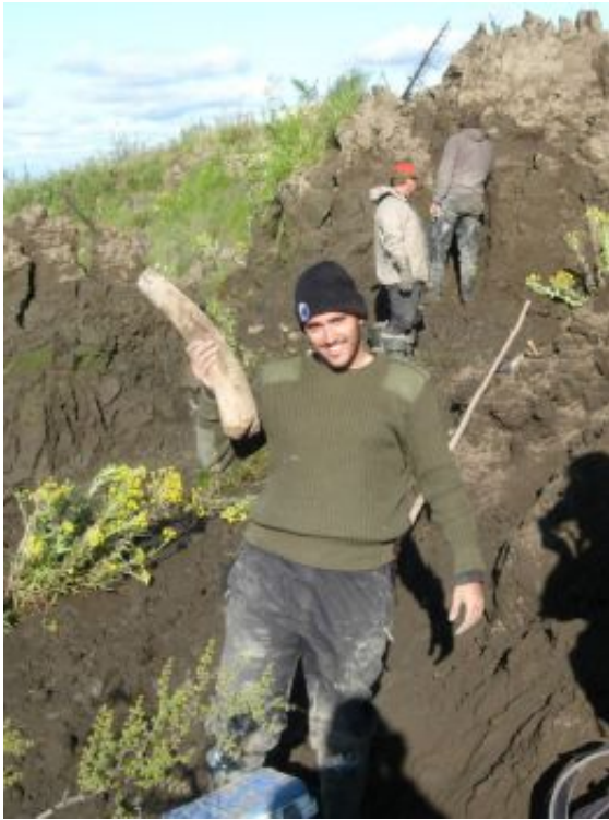
A field worker holds part of a mammoth tusk