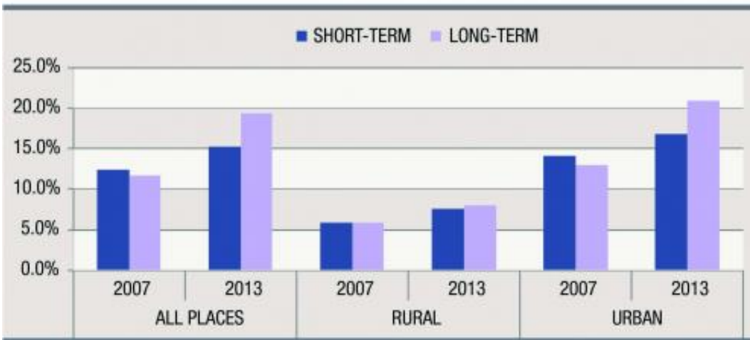
PERCENT WITH COLLEGE OR ADVANCED DEGREE BY PLACE, 2007 AND 2013

This graph shows the percent of long-term unemployed with a college or advanced degree by place for 2007 and 2013.