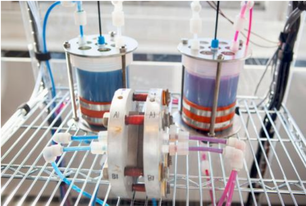
A prototype flow battery in Aziz's lab at Harvard School of Engineering and Applied Sciences.

The active components of electrolytes in most flow batteries have been metals. Vanadium is used in the most commercially advanced flow battery technology now in development, but its cost sets a rather high floor on the cost per kilowatt-hour at any scale. Other flow batteries contain precious metal electrocatalysts such as the platinum used in fuel cells.