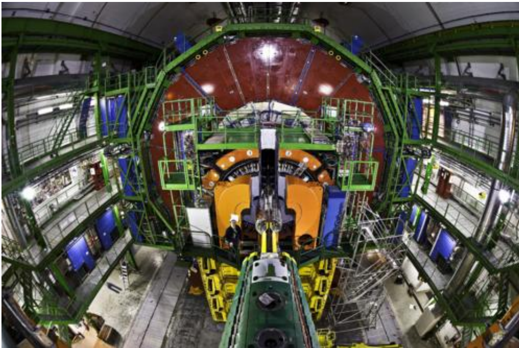
The “Compact” Muon Solenoid detector at the Large Hadron Collider at CERN.

The first family, which includes the electron, the electron neutrino and the up and down quarks, gives us the familiar matter in the form of protons, neutrons and electrons . (The particles of the second and third families are not part of ordinary matter. They existed in the first fraction of a second of the universe, but disintegrated very quickly to become particles in the first family.)