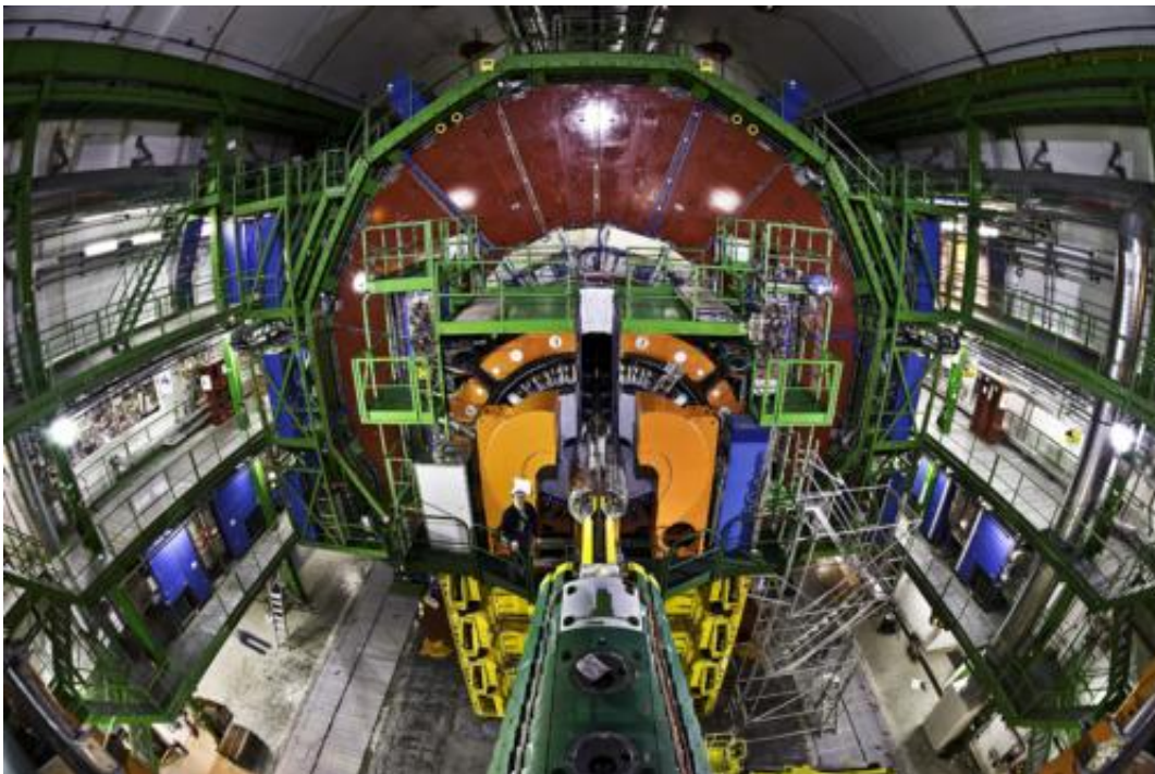
The “Compact” Muon Solenoid detector at the Large Hadron Collider at CERN.

The first family, which includes the electron, the electron neutrino and the up and down quarks, gives us the familiar matter in the form of protons, neutrons and electrons . (The particles of the second and third families are not part of ordinary matter. They existed in the first fraction of a second of the universe, but disintegrated very quickly to become particles in the first family.)