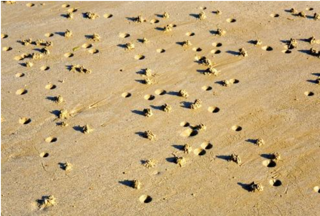
Lugworm ( Arenicola marina ) casts at low tide.

"In our study, additives, such as triclosan (an antimicrobial), that are incorporated into plastics during manufacture caused mortality and diminished the ability of the lugworms to engineer sediments," Browne said. "Pollutants on microplastics also increased the vulnerability of lugworms to pathogens while the plastic itself caused oxidative stress."