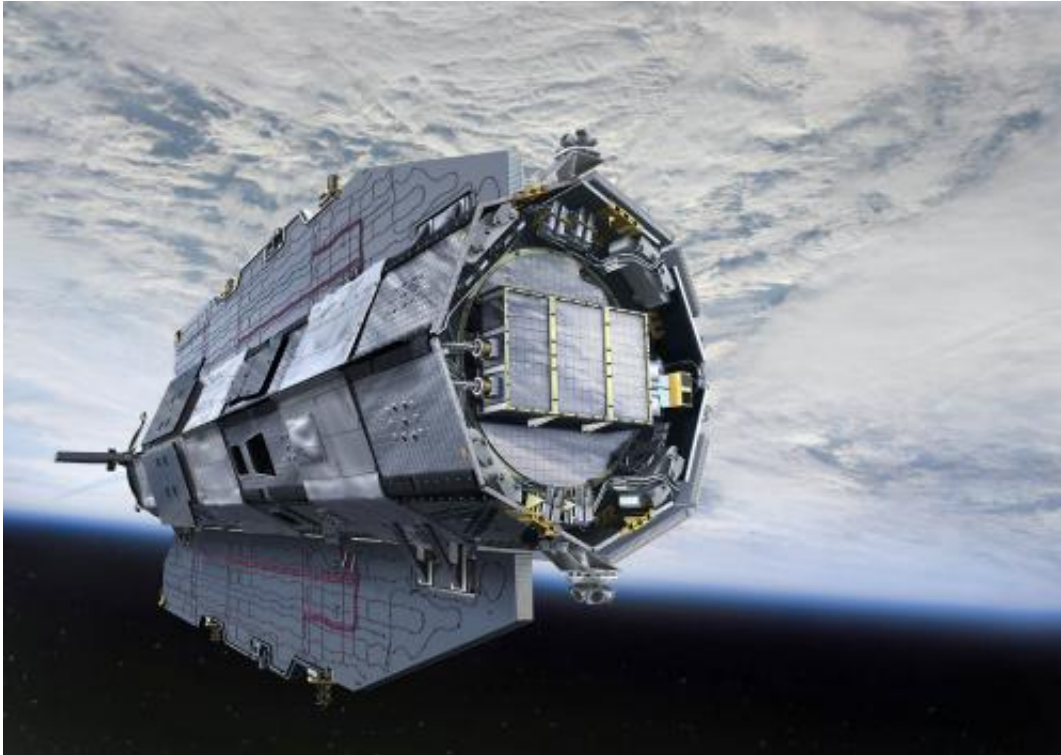
GOCE.

After more than doubling its planned life in orbit, the satellite recently ran out of fuel and reentered the atmosphere, largely disintegrating in the process. Although it is no longer in orbit, the real mission is only just starting because scientists will be analysing the data for years to come to help understand many aspects of our world.