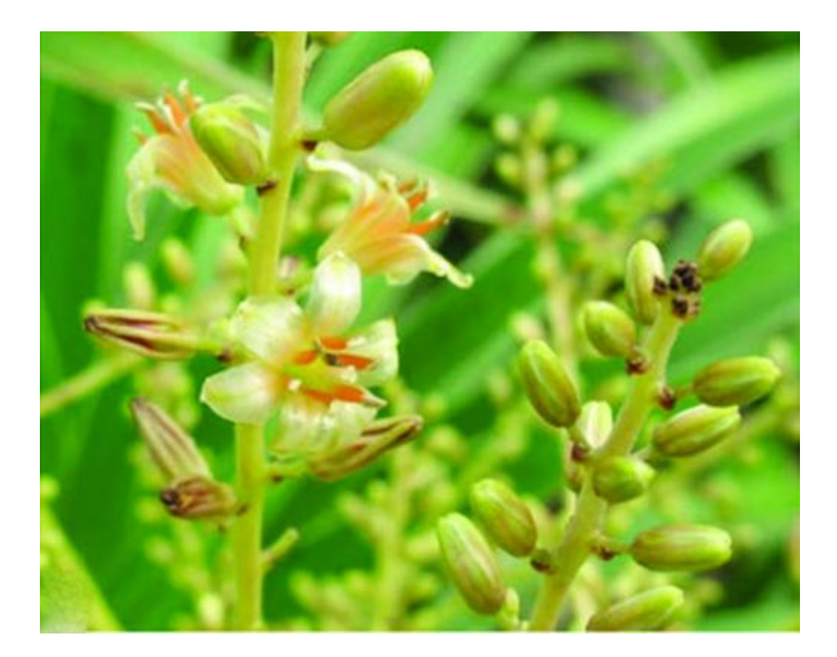
This image shows flowers of Dracaena kaweesakii.