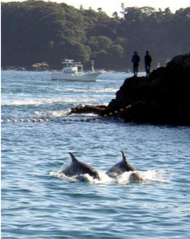
Illustration: two Risso's dolphins are herded by fishing boats near the village of Taiji, central Japan.

Tokyo-based conservationist group Iruka & Kujira (Dolphin & Whale) Action Network (IKAN) said the plan was "unfortunate" for the town.