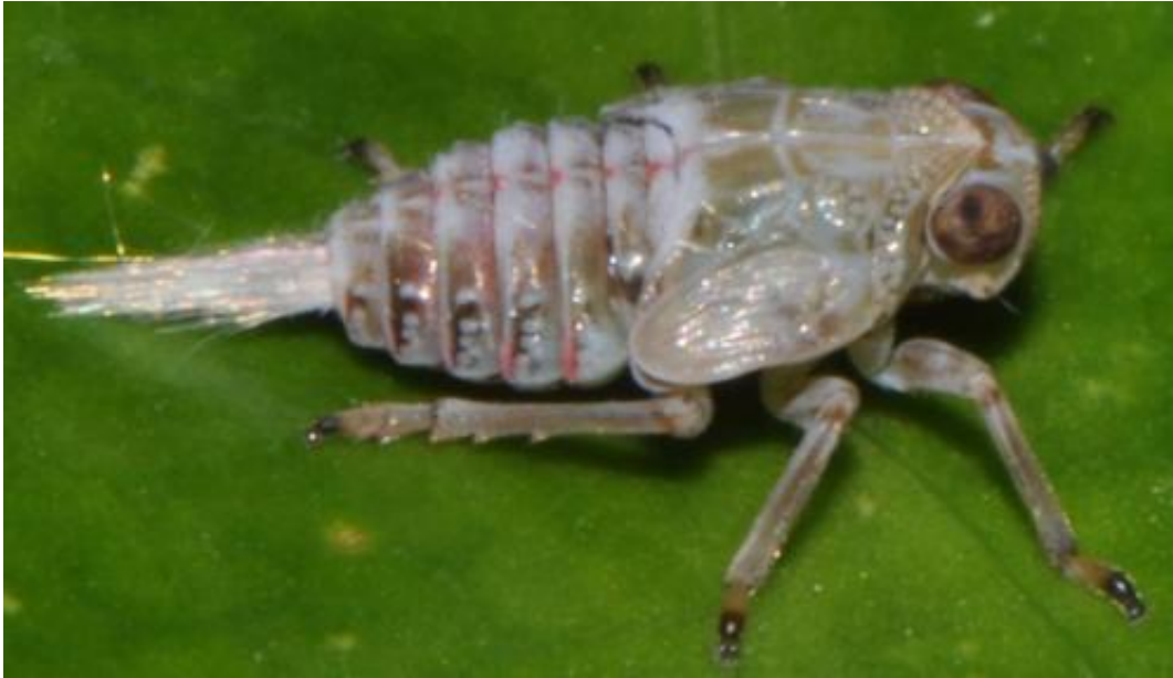
Photograph of an Issus nymph.