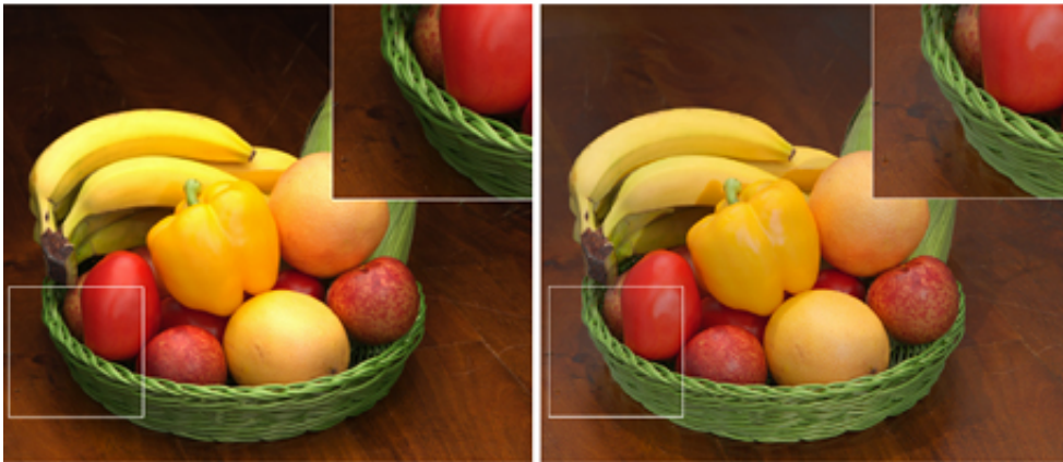
(c) With the soft lighting modifier