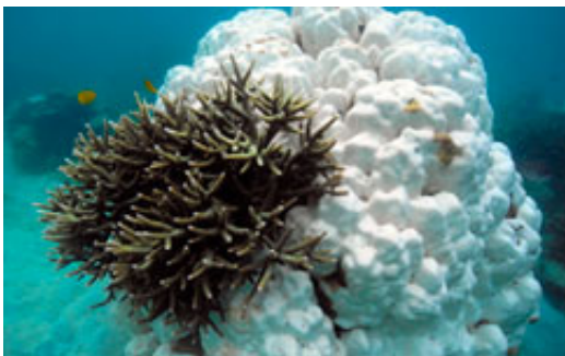
Healthy coral on a bleached neighbour.

'They also provide a range of vital benefits to humanity, like food, jobs and protection from the sea. Globally, over half a billion people rely on reef services to some extent.'