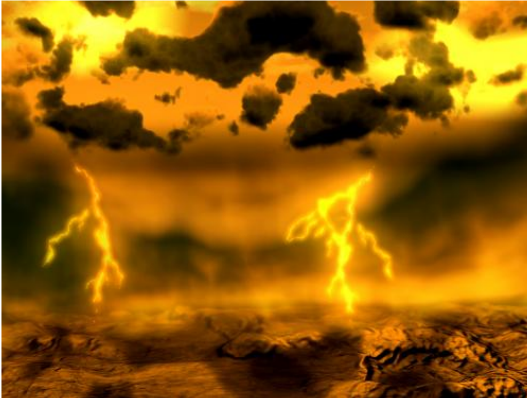
Artist's conception of the atmosphere of Venus.

You can read more details about the windsurfing rover here . If this gets to the mission phase, this would represent the first time that any robot landed on Venus since the Soviet Venera landers; the last attempt was in the 1980s.