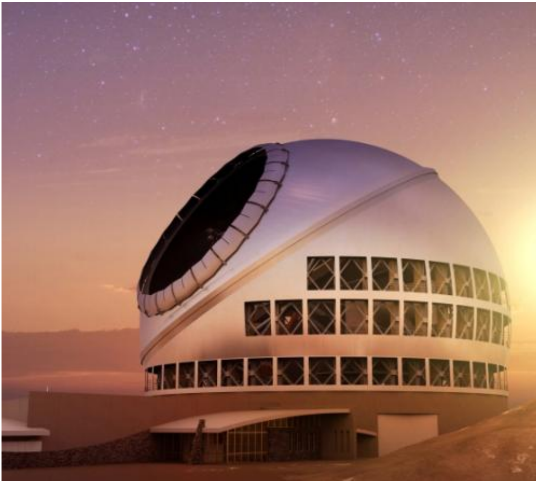
Artist's rendering of Thirty Meter Telescope

(Phys.org) —With the signing last week of a "master agreement" for the Thirty Meter Telescope—destined to be the most advanced and powerful