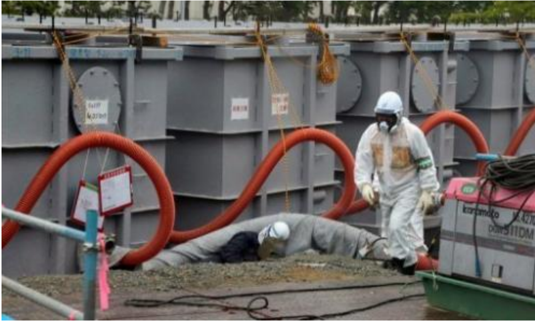
A Tokyo Electric Power worker walks next to waste water tanks at Japan's Fukushima nuclear plant on June 12, 2013.

A series of problems, and delays in announcing them to the public, have added to the impression that the huge utility is not on top of the clean-up.