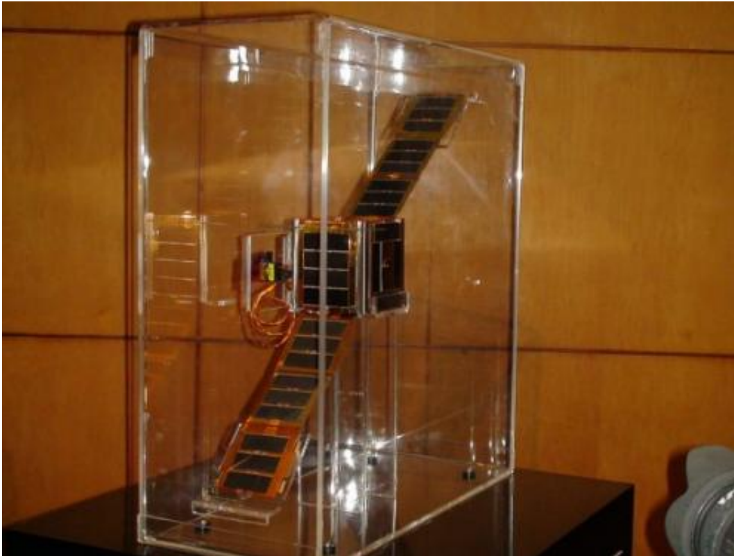
EE-01 Pegaso before deployment.

It's sometimes tough being a satellite in Earth orbit these days.