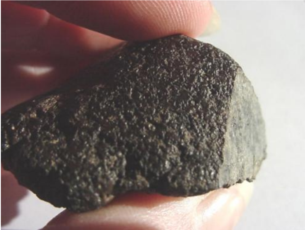
Mars Meteorite.

We know that both Earth and Mars have been hammered by countless asteroids in their history long. Some of these impacts are so powerful, rock debris is ejected into escape orbits. This blasted rock could orbit the Sun for eons and then re-enter the atmosphere of another planet.