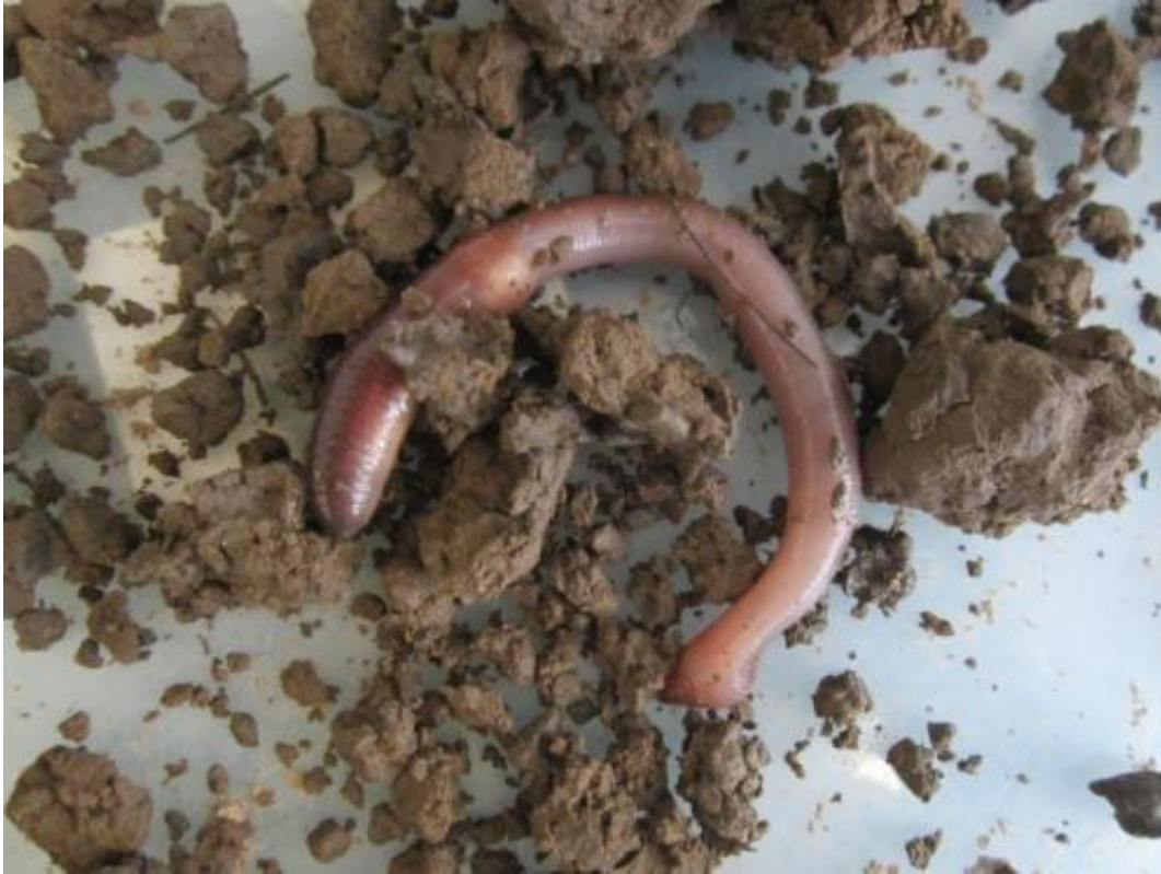
Earthworm ( Lumbricus terrestris).

The proof of concept study involved keeping modern-day Lumbricus terrestris at different temperatures, then carrying out isotopic testing on the calcite granules excreted. This successfully demonstrated that the granules remembered the temperature at which they were formed.