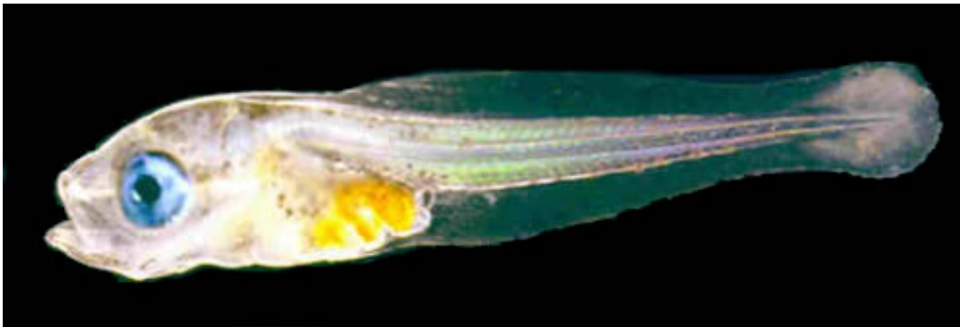
Larval cod.

Friedland and his colleagues found that ocean water temperatures of the Northeast Continental Shelf have increased in recent decades, but these changes have not been uniform over the entire ecosystem. Warm water habitats (16 to 27 C, 60 to 80 F) have increased and cool water habitats (5 to 15 C, 41 to 59 F), historically the core habitats in the ecosystem, have declined; however, the coldest habitats in the ecosystem (1-4 C, 34-39 F) have either stayed the same or increased slightly during the study period 1982-2011. This discontinuity is attributed to changes in circulation in the northern Gulf of Maine associated with the Labrador Current.