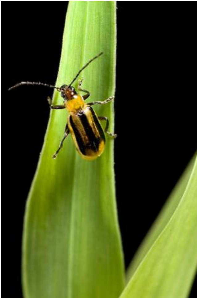
Adult female western corn rootworm, Diabrotica virgifera , on a corn leaf.

Each spring, the western corn rootworm ( Diabrotica virgifera ) awakens