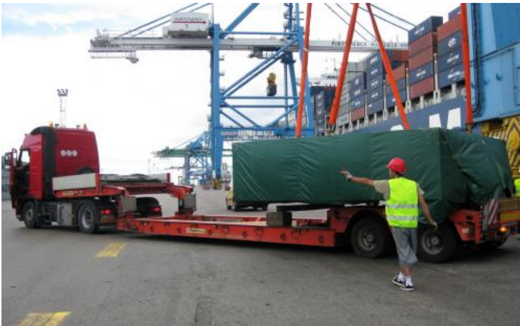
Unloading the precious goods in Fos-sur-Mer.

The poloidal field conductors for ITER will be made out of niobium-titanium (NbTi), an alloy that is too precious to be used for testing purposes. The dummy conductor delivered this week is composed of copper strands inserted into a stainless steel jacket (AISI 316LN). It will be used for validating the fabrication process of ITER poloidal field coil number 5 (PF5).