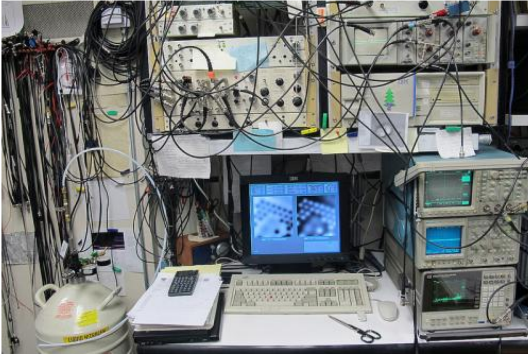
A Boy and His Atom Behind the Scenes.

Using the smallest object available for engineering data storage devices - single atoms - the same team of IBM researchers who made this movie also recently created the world's smallest magnetic bit. They were the first to answer the question of how many atoms it takes to reliably store one bit of magnetic information: 12. By comparison, it takes roughly 1 million atoms to store a bit of data on a modern computer or electronic device. If commercialized, this atomic memory could one day store all of the movies ever made in a device the size of a fingernail.