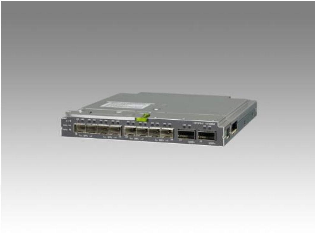
Figure 3: PRIMERGY Converged Fabric Switch.

The newly developed FUJITSU Intelligent Networking and Computing Architecture can virtualize resources in three ICT areas - datacenters, wide area networks, and smart devices - each of which features different characteristics and requirements. By administering and controlling these virtualized resources on two layers, a "virtual infrastructure layer" and a "distributed service platform layer," the technology is able to achieve optimal service levels while improving the quality of experience for the end user.