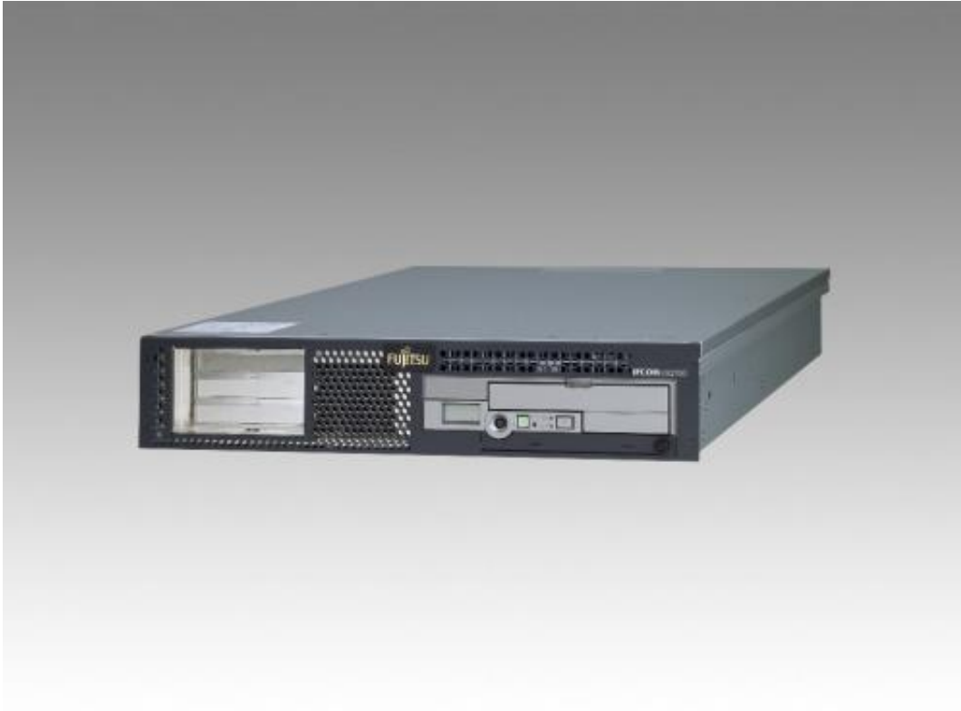
Figure 4: FUJITSU Network IPCOM VX Series.