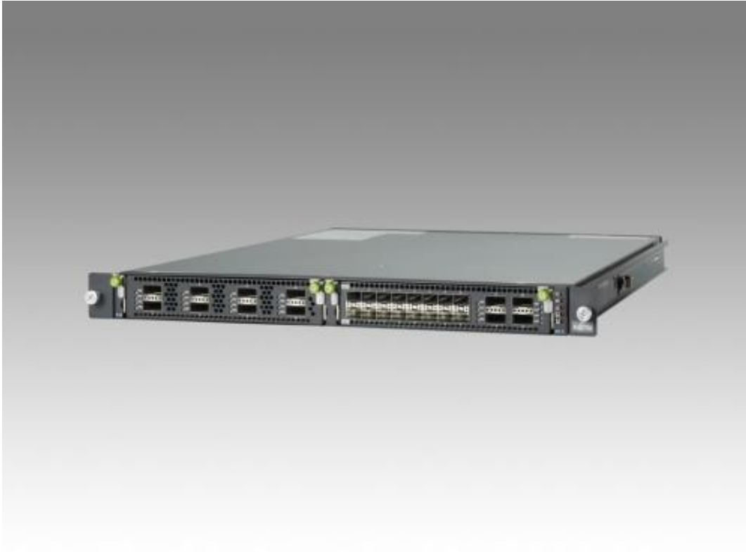
Figure 2: Converged Fabric Switch.

In order to accommodate the explosive pace of smart device growth and heavy Internet traffic in recent years, progress has been made in expanding the size of datacenters while making further speed and capacity improvements to wireless and optical wide area networks. Going forward, networks will come into even greater use in connecting a wide variety of systems and social infrastructure , and it is expected that huge volumes of diverse information will be able to be processed in real time. When this occurs, if data processing continues to be over-concentrated in datacenters, slow response times and service disruptions are likely to result in the near future. To prevent these issues, computing environments will need to be distributed across different ICT categories, which must be made to dynamically coordinate with each other. For this to be achieved, a technology that can optimally connect distributed