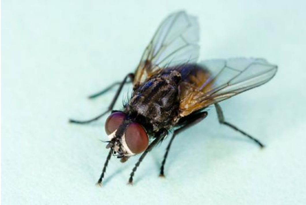
Common house fly, Musca domestica .

The house fly is often considered merely a nuisance. But these flies are capable of transmitting animal and human pathogens that can lead to foodborne diseases, including Escherichia coli , Salmonella , and Shigella bacteria.