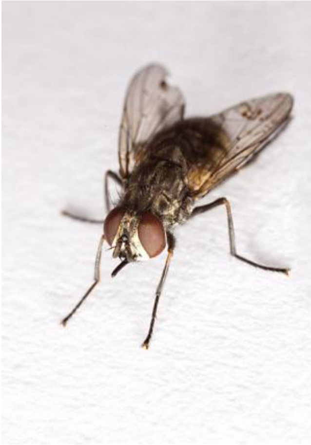
Stable fly, Stomoxys calcitrans .

In laboratory tests, scientists used SGHV-infected house flies collected from livestock farms in Denmark and a strain of Florida house fly—"Orlando normal"—reared at CMAVE. Virus obtained from one of the infected Danish house flies was injected into the Florida flies, which were found to be highly susceptible to it.