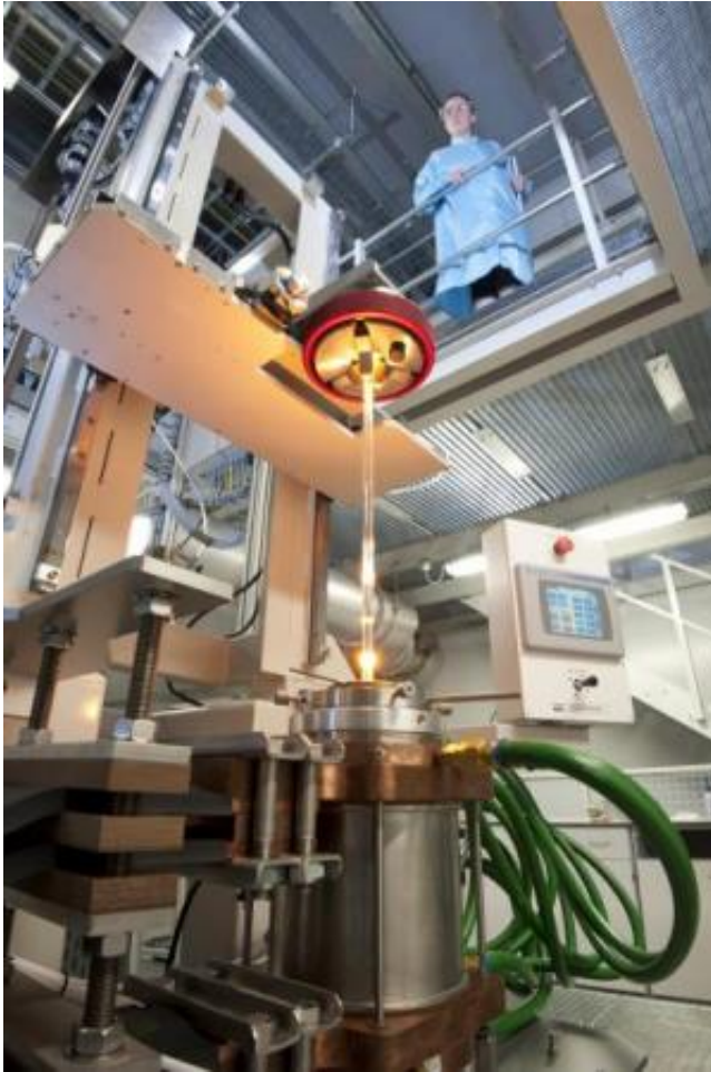
This is a fibre drawing tower at ORC.

To bridge this technology divide, the ICAN consortium, an EU-funded project initiated and coordinated by the École polytechnique and composed of the University of Southampton's Optoelectronics Research Centre, Jena and CERN, as well as 12 other prestigious laboratories around the world, aims to harness the efficiency, controllability, and high average power capability of fibre lasers to produce high energy, high repetition rate pulse sources.