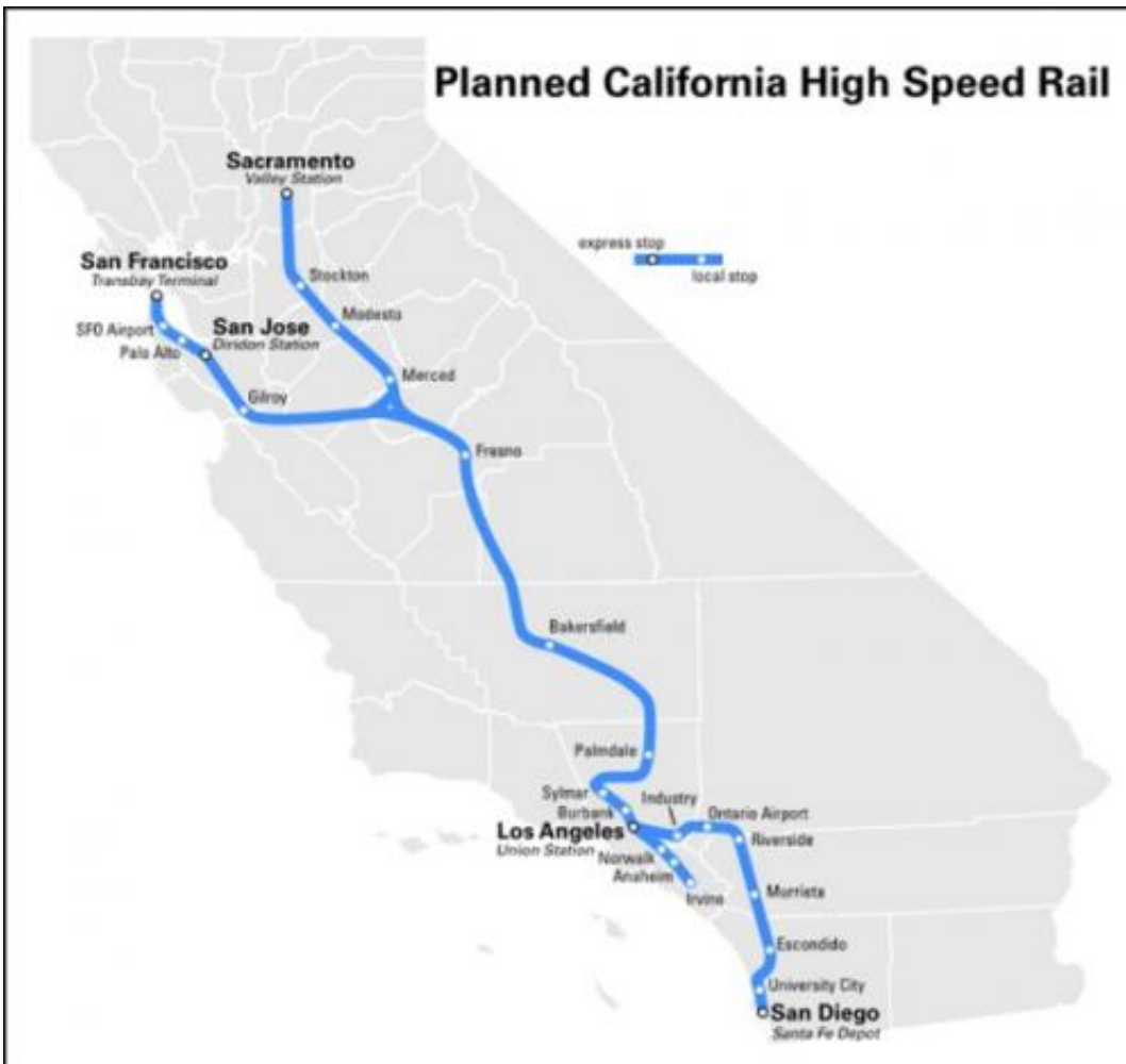
Planned high-speed rail system in California.

(Phys.org) —Bullet trains fuel real-estate booms, improve quality of life