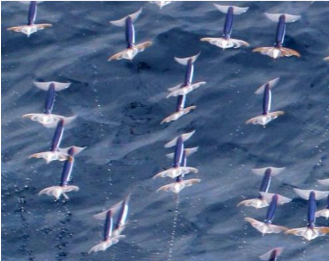
Image taken by Kouta Muramatsu of Hokkaido University on July 25, 2011 shows the oceanic squid flying in the air in the northwest Pacific Ocean. It propels itself out of the ocean by shooting a jet of water at high pressure, before opening its fins to glide at up to 11.2m per second, the university said.

A species of oceanic squid can fly more than 30 metres (100 feet) through the air at speeds faster than Usain Bolt if it wants to escape predators, Japanese researchers said Friday.