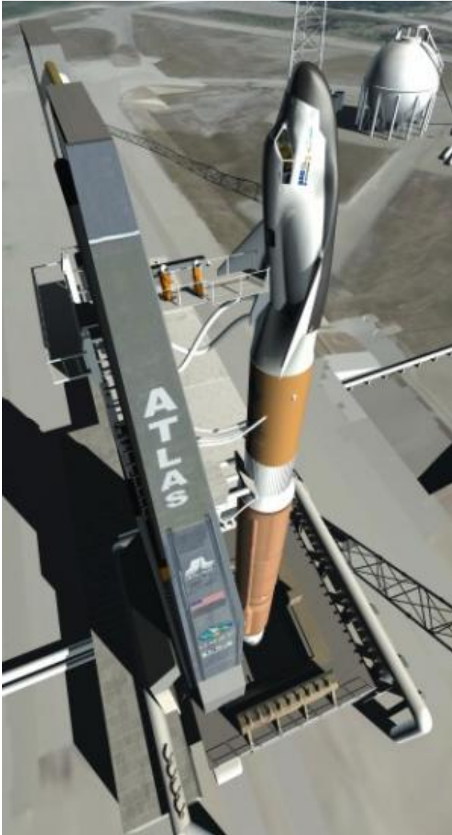
Dream Chaser awaits launch atop Atlas V rocket.