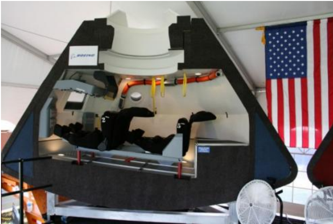
Boeing CST-100 capsule mock-up, interior view.

Sierra Nevada plans to start atmospheric drop tests of an engineering test article of the Dream Chaser from a carrier aircraft in the next few months in an autonomous mode. The test article is a full sized vehicle.