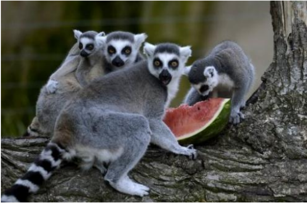
Photo illustration of lemurs. In the hit cartoon film "Madagascar", the island's lemurs are a lovable bunch of extroverts, but they are also among the world's most threatened primates, conservationists warned on Monday.

In the hit cartoon film "Madagascar", the island's lemurs are a lovable bunch of extroverts, but they are also among the world's most threatened primates, conservationists warned on Monday.