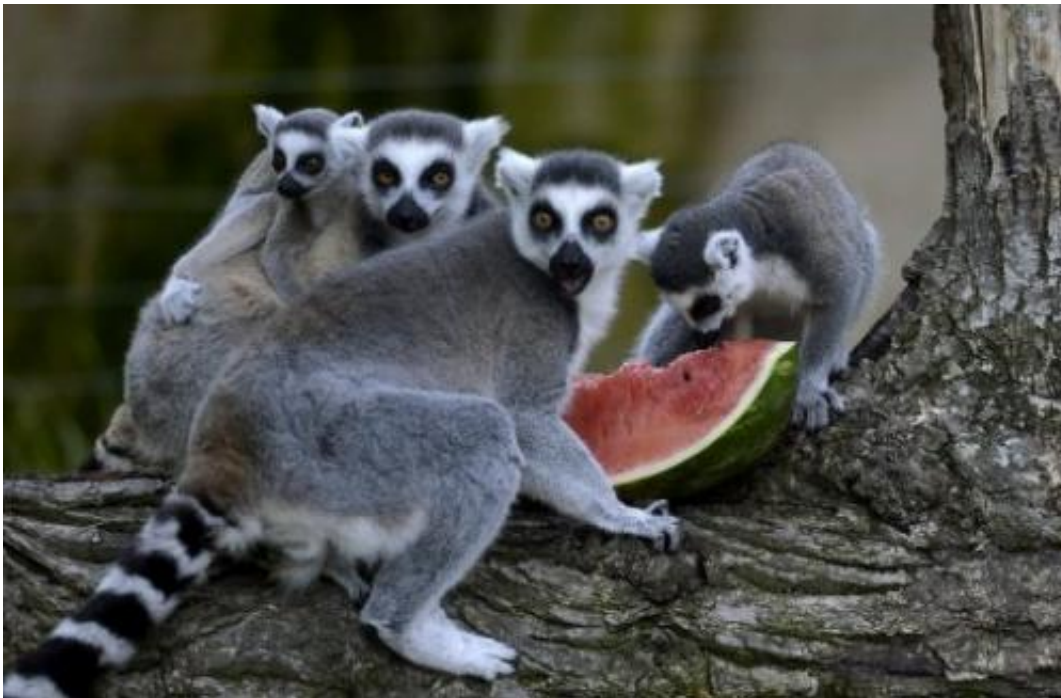
Photo illustration of lemurs. In the hit cartoon film "Madagascar", the island's lemurs are a lovable bunch of extroverts, but they are also among the world's most threatened primates, conservationists warned on Monday.

In the hit cartoon film "Madagascar", the island's lemurs are a lovable bunch of extroverts, but they are also among the world's most threatened primates, conservationists warned on Monday.