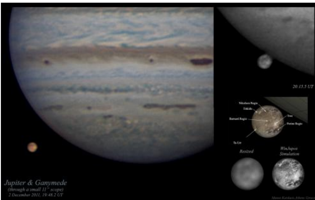
Amateur photographs of Jupiter and Ganymede, accompanied with a professionally-obtained labeled map (bottom right).